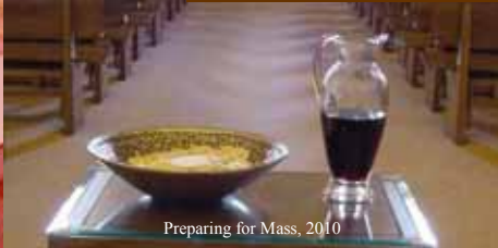
Preparing for Mass, 2010