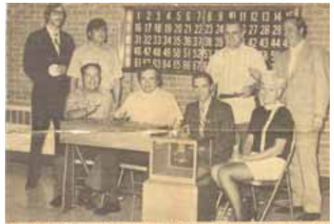
ST. SCHOLASTICA Parish, 7600 Jones ave., Woodridge, is passing another year of life.