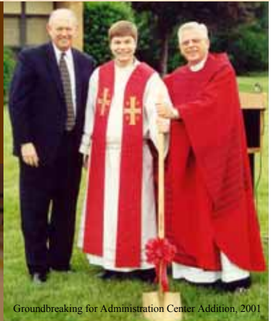
Groundbreaking for Administration Center Addition, 2001