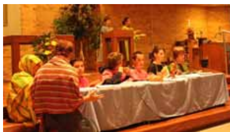
Last Supper Reenactment