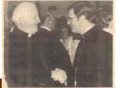
25th Anniversary Celebration, 1987