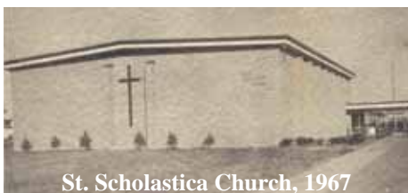
St. Scholastica Church, 1967