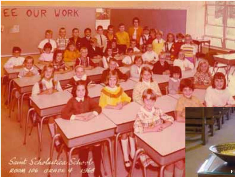
Saint Scholastica School ROOM 106 GRADE 4 1968